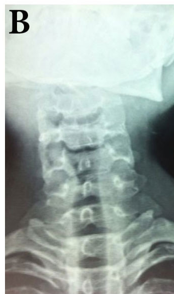
Figure 1. Anteroposterior and lateral radiographs of the cervical spine showing destruction of the atlanto-axial articulation with widening of the dens-basilar interval and the atlanto-dens interval.

junction probably begins as an infection in the retropharyngeal space with subsequent infection of surrounding vertebral structures. Progression of the disease causes increasing ligamentous involvement, with later stages characterized by destruction of bone [16].