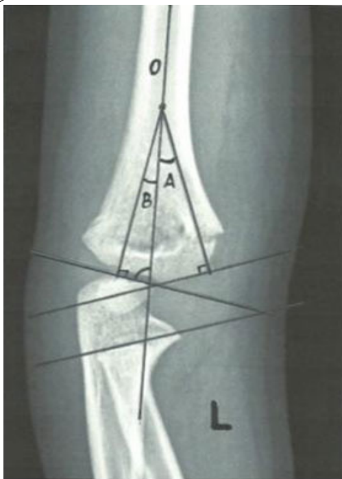
Figure 2. Radiograph immediately after fracture of the elbow. Baumann's angle is 76° that accepted as normal. TCI>1 indicate severe varus deformity.