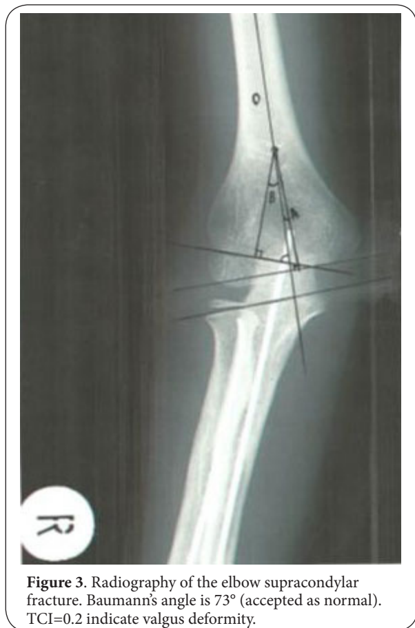
Figure 3. Radiography of the elbow supracondylar fracture. Baumann's angle is 73° (accepted as normal). TCI=0.2 indicate valgus deformity.

of measurement of the TCI to determine better evaluation of treatment outcome of the fracture (Figure 3). The result of the present study can have implications on the general population of children with supracondylar fractures of the elbow because the sample population in this study is the same as in previous studies.